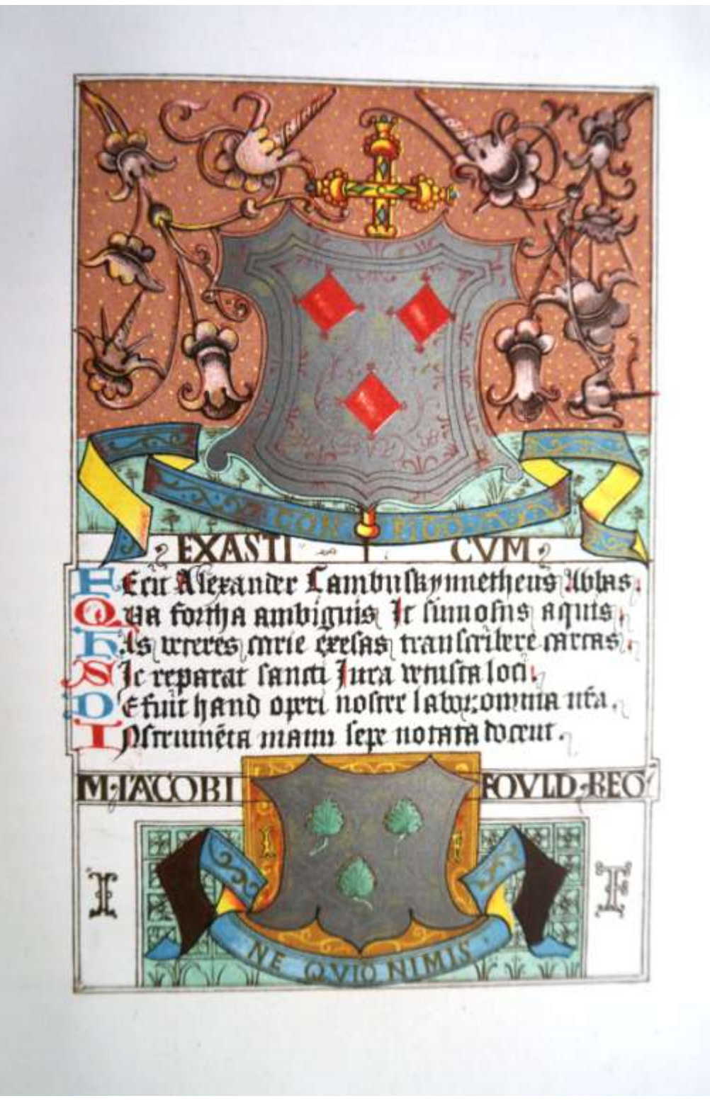
Figure 3 The armorial bearings of the abbot and the clerk register in 1535.