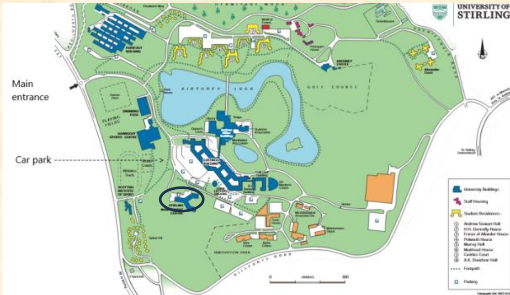
Map of the university campus, also showing the hotel (circled)

Getting there https://www.stir.ac.uk/about/getting-here/ and map https://www.ciol.org.uk/sites/default/files/University%20of%20Stirling%20Campus%20Map.pdf (for more detailed version see above link)